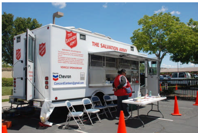
The Salvation Army Canteen on display at the East County Emergency Preparedness Fair on May 22, 2010.