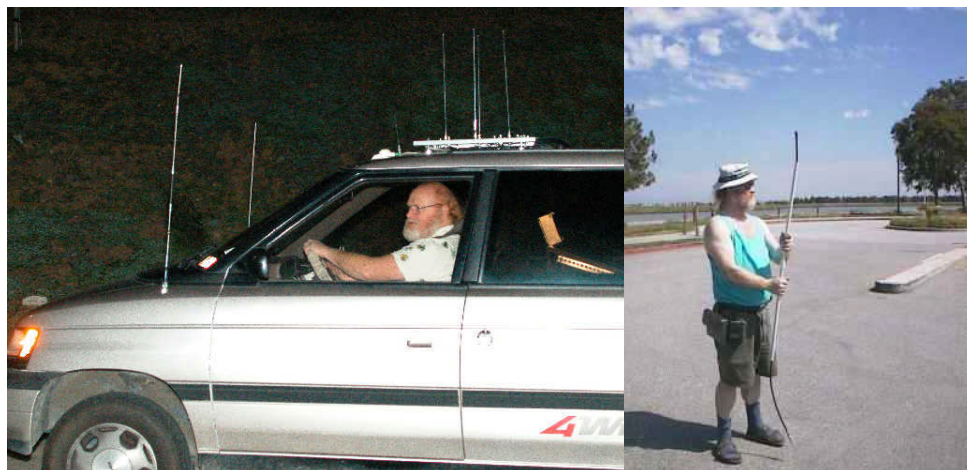
KN6FW on RDF missions, while mobile and on foot.